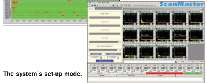
The system's set-up mode.

A variety of systems are available for either wheels, axles or combined wheel and axle assemblies. Widely proven in their respective fields, they provide fast scanning and accurate data acquisition. Inspection results are displayed and reported in standard or customized formats.