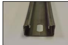
Location Case Upright Bar Cat N° 086/009995