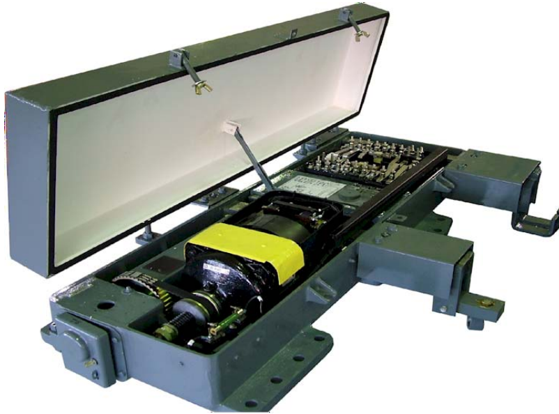
WBS Style 63 Point Machine following refurbishment at Unipart Rail.

For further information on how we can provide you with a repair and refurbishment solution for all your products, contact: