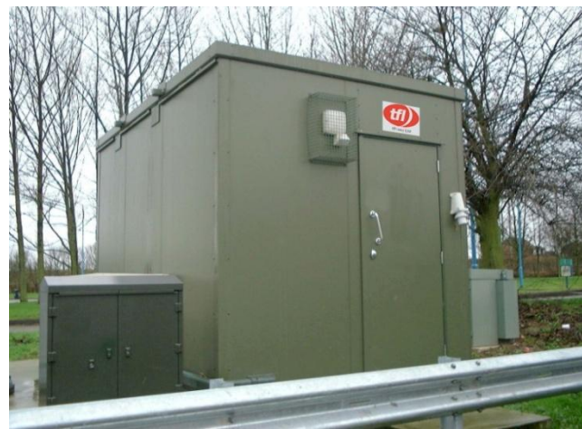
Quality REBs for housing switchgear and telecom equipment

Our suppliers have developed a diverse and dynamic range of innovative, value-for-money equipment buildings for the rail industry. Flexibility, innovation and an in-depth understanding of the marketplace are at the heart of our specially tailored solutions, backed by quality of design, engineering, manufacture and delivery.