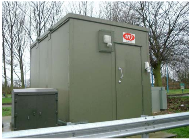
Quality REBs for housing switchgear and telecom equipment

tfl has developed a diverse and dynamic range of innovative, value-for-money equipment buildings for the rail industry. Flexibility, innovation and an in-depth understanding of the marketplace are at the heart of tfl specially tailored solutions, backed by quality of design, engineering, manufacture and delivery.