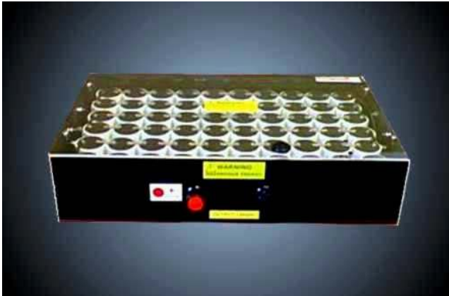
Cat N° 0054/003080

Sealed lead acid cells requiring no separate battery room or racking