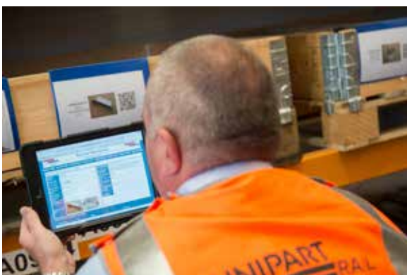
Materials Management in Remote Warehouse