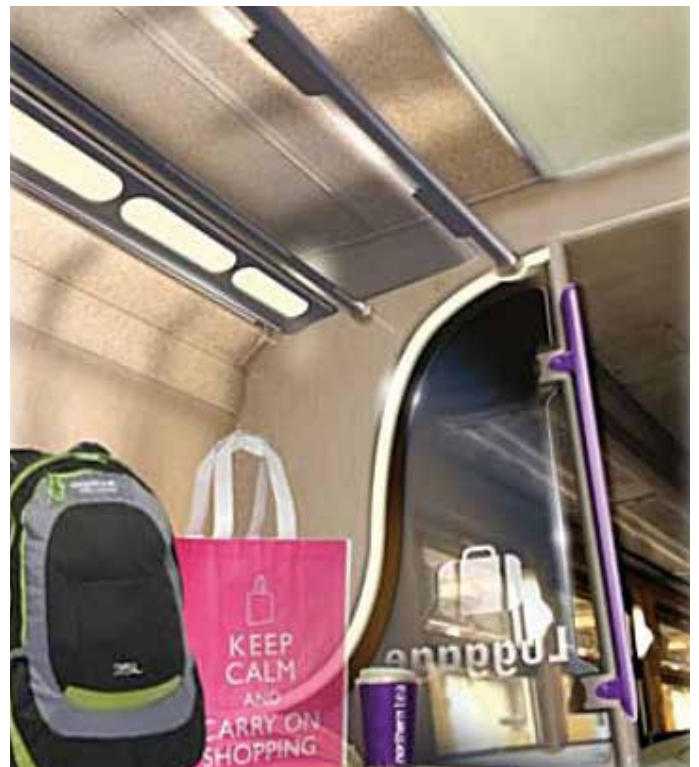
Enhanced storage facilities designed and managed by Unipart Rail