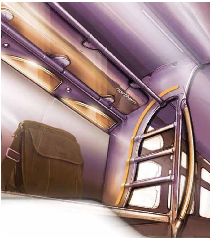
Existing storage facilities