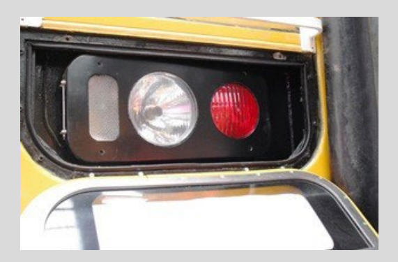
New Non-Drivers Side headlight

The lamp enclosures can be fitted with an all halogen bulb version, as a direct replacement for the original enclosures or a combined standard headlight H3 and H4 bulb with new LED technology marker and tail lights. The LED unit consumes less power and has a considerably longer service life.