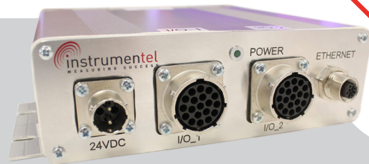
The Diagnostic Hub

The data is now being used to determine the health of key assets on the vehicle such as the engine, battery and brake systems.