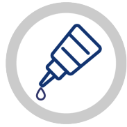
Grease & Oil